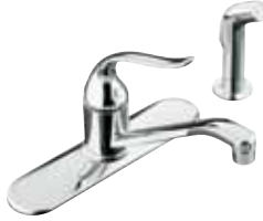
Kohler Coralais® Kitchen Faucet Polished Chrome (CP) K-15172-F