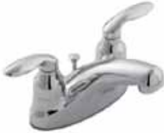
K-15241-4 (Owner's Bath)

Kohler Coralais® Centerset Faucet in Polished Chrome (CP)