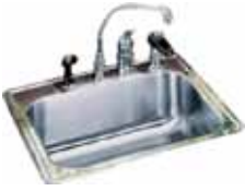
Elkay Dayton 8" Deep, Drop-in Stainless Steel Sink D12522