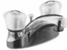
K-15241-7 (Secondary Baths)